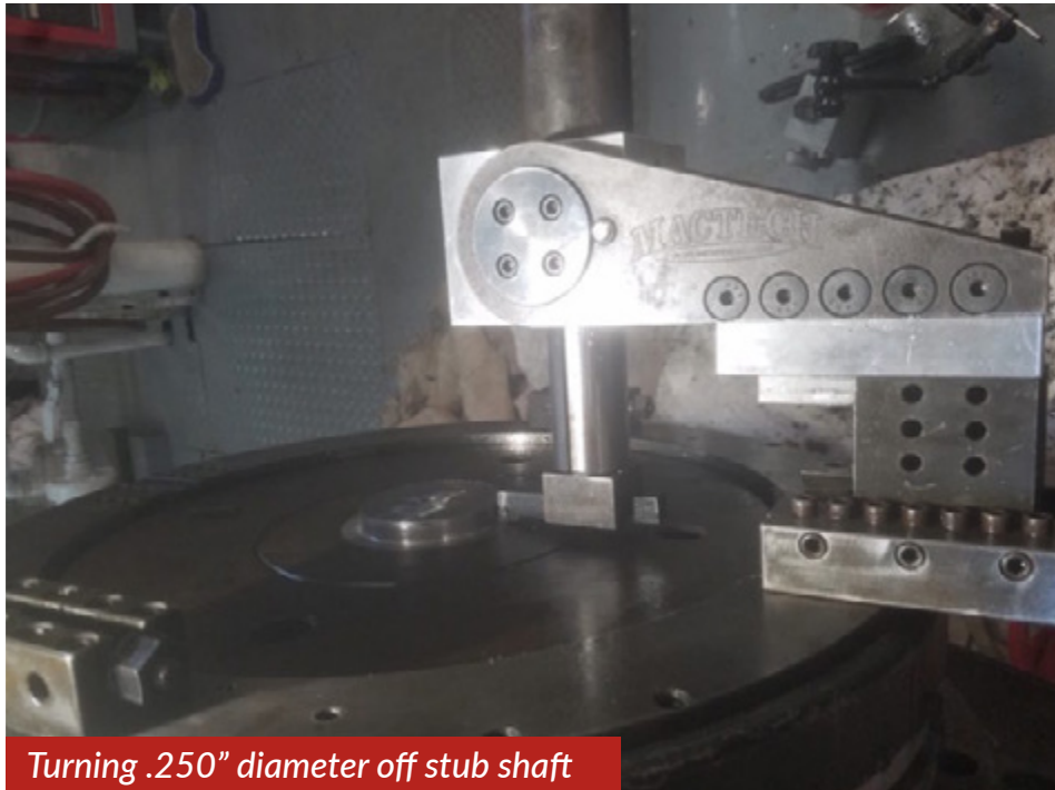
Turning .250" diameter off stub shaft