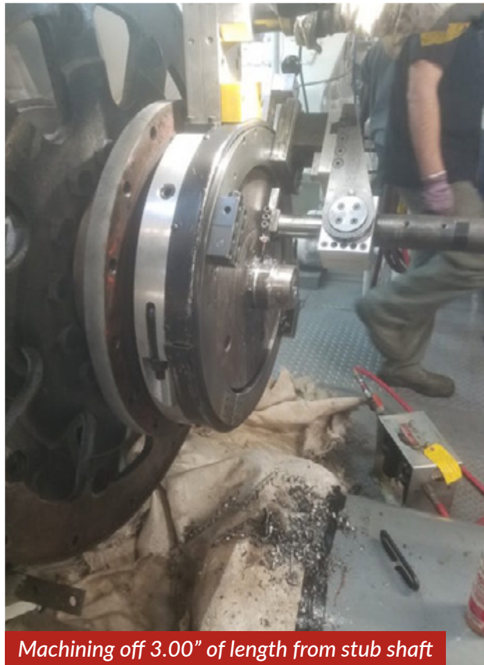
Machining off 3.00" of length from stub shaft