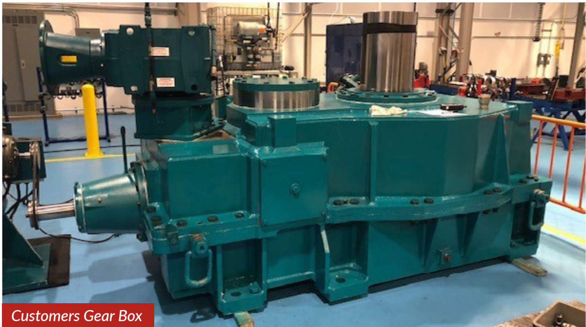
Customers Gear Box