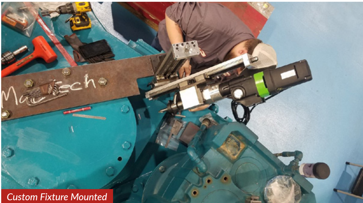
Custom Fixture Mounted