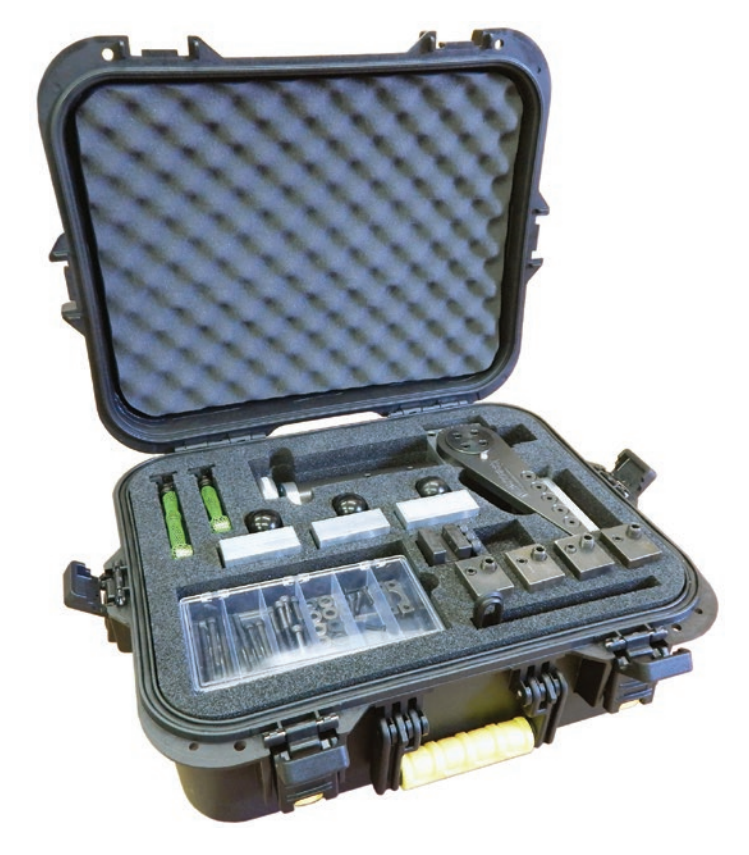
10 inch Adjustable Counterbore Attachment Kit