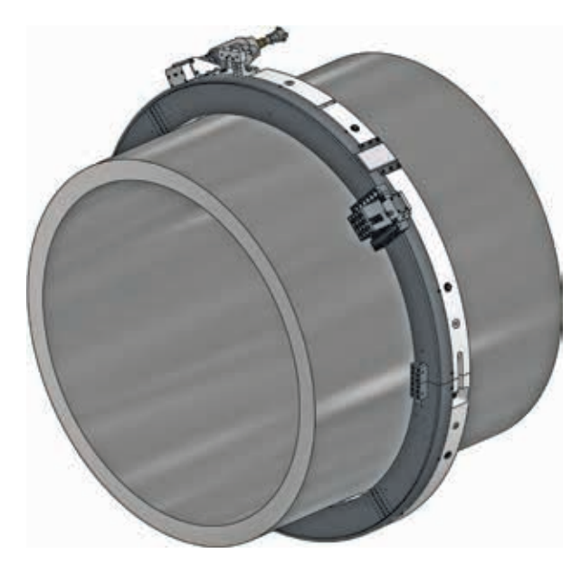
Mactech 856WD Clamshell Lathe