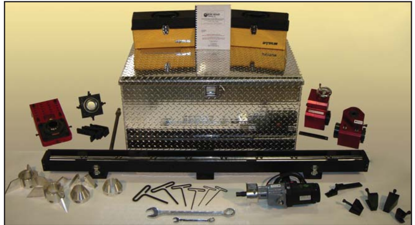
BB2250 Bore Repair Package

Selections of various length boring bars are available.