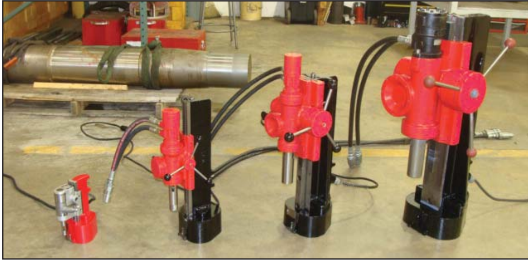
Mactech's Line of Hydraulic Magnetic Drills

Mactech Hydraulic Magnetic Drills provide compact, powerful drilling in tight spaces. The magnetic base provides a safe and secure attachment to the drilling surface at almost any angle - including vertically and horizontally. If the magnetic base becomes detached from the workpiece the drill automatically stops. The HMD1M spindle can be removed and reversed for drilling upward. A pendant control allows convenient remote operation. Simple to operate, easy to maintain, Mactech's Hydraulic Magnetic Drills are the powerful solution for your drilling needs.