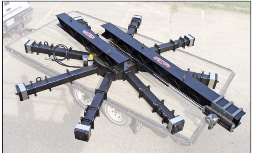
LDFM 5000 Large Diameter Facing Machine

The Mactech LDFM 5000 Facing Machine is designed for on-site precision grinding, single point, mitering and rotary milling capabilities on large diameter flanges. Adjustable mounting legs secure the machine to the inside diameter of the workpiece. Features include mechanical feed from multiple ramps and variable speed in radial and axial planes. Optional tool holders, milling heads and motors are available.