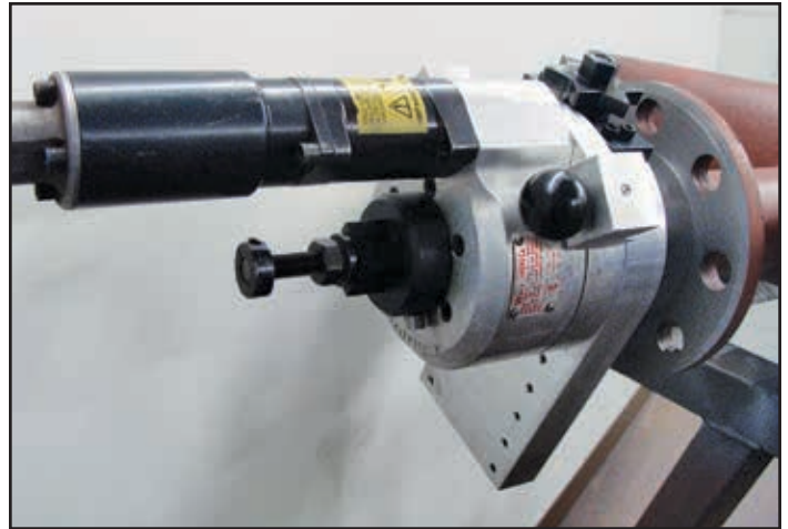
Mactech's Mini Flange Facer

Mactech's compact and reliable Mini Flange Facer is an easy to use portable flange facer for resurfacing pipe and tube flanges, with no special training required. The Mini Flange Facer rigidly mounts to the inside diameter of the pipe for stable and accurate machining. The self-centering draw rod makes installation quick and easy. This amazingly powerful and versatile tool cuts through the toughest material, and works on a wide range of face diameters. Cutter blades machine smoothly, without requiring cutting fluids. The Mini Flange Facer produces a clean, continuous chip, and squares off the end of the pipe. For resurfacing pipe and tube flanges, Mactech's Mini Flange Facer is the solution.