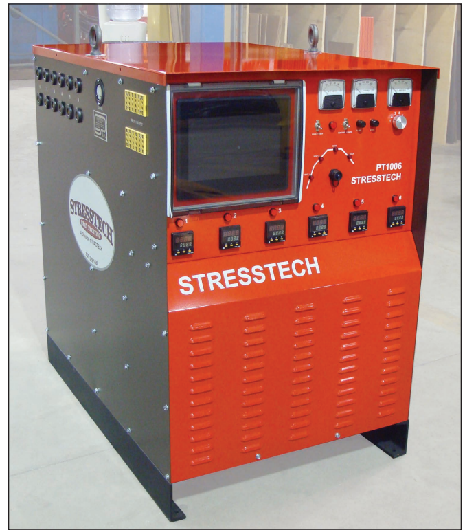
Stresstech PT1006 Heat Treating Console

Stresstech's PT1006 Portable Heat Treating Console provides 1000 amps of power to six 300 amp resistance heating zones. Each zone may be run as part of a profile or operated as an independent ramp to set point controller. Meters, digital displays and LED lighting for ease of operation. Panel mounted Cam-Loks provide secure, fast and easy connections. Two, six-circuit type "K" thermocouple jack strips located on the side panel permit connection to an optional temperature recorder. Fan forced air system. 300 amp zone protection and thermal overload sensors assure safe operation. Calibration and maintenance are easy with the removable control drawer.