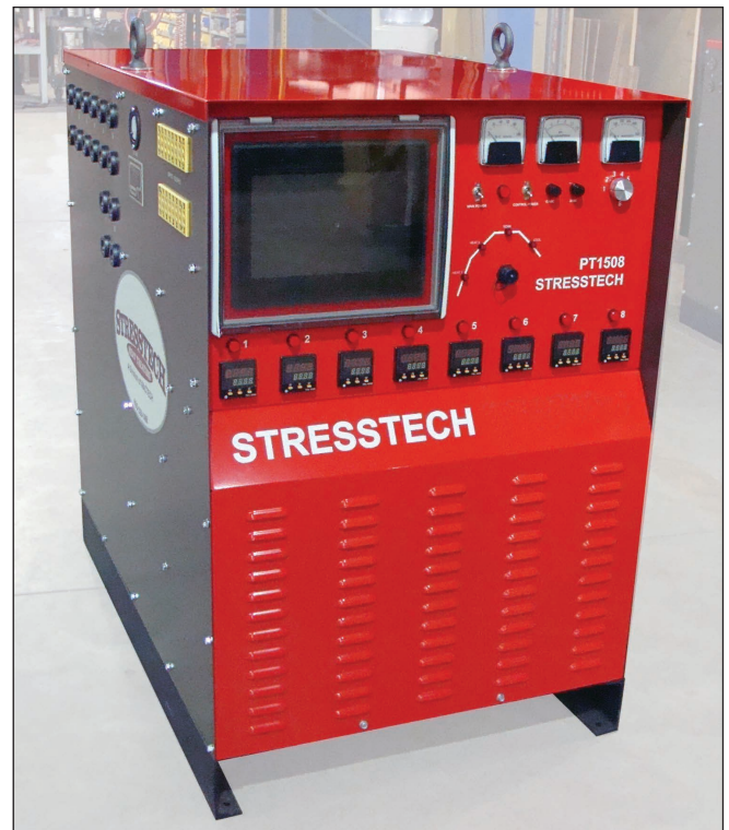
Stresstech PT1508 Heat Treating Console

Stresstech's PT1508 Portable Heat Treating Console provides 1500 amps of power to eight 300 amp resistance heating zones. Each zone may be run as part of a profile or operated as an independent ramp to set point controller. Meters, digital displays and LED lighting for ease of operation. Panel mounted Cam-Loks provide secure, fast and easy connections. Two, eight-circuit type "K" thermocouple jack strips located on the side panel permit connection to an optional temperature recorder. Fan forced air system. 300 amp zone protection and thermal overload sensors assure safe operation. Calibration and maintenance are easy with the removable control drawer.