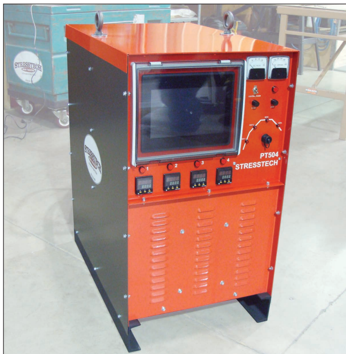
Stresstech PT504 Heat Treating Console

Stresstech's PT504 Portable Heat Treating Console provides 500 amps of power to four 300 amp resistance heating zones. Each zone may be run as part of a profile or operated as an independent ramp to set point controller. Meters, digital displays and LED lighting for ease of operation. Panel mounted Cam-Loks provide secure, fast and easy connections. Two, four-circuit type "K" thermocouple jack strips located on the rear panel permit connection to an optional temperature recorder. Fan forced air system. 300 amp zone protection and thermal overload sensors assure safe operation. Calibration and maintenance are easy with the removable control drawer.