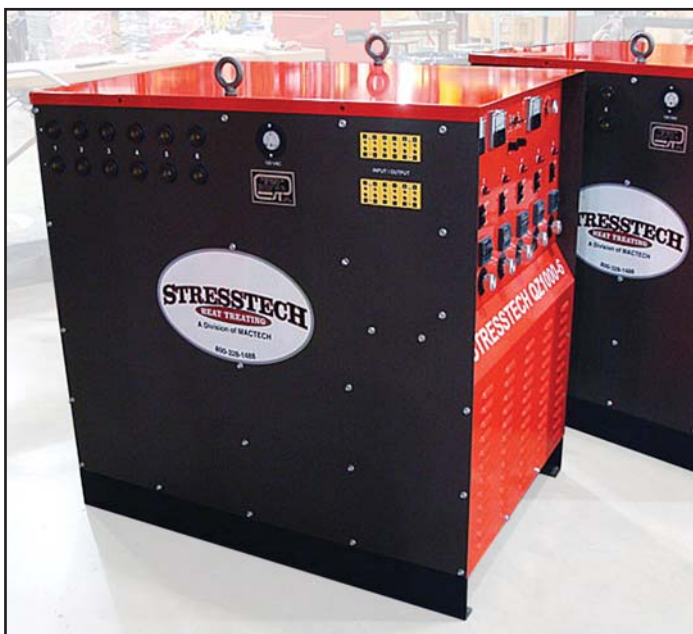
QZ1000-6 Side Panel