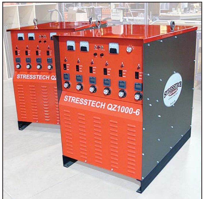
Stresstech QZ1000-6 Heat Treating Console

Stresstech's QZ1000-6 Portable Heat Treating Console provides 1000 amps of power to six individual 300 amp resistance heating zones. Each zone is individually controlled, allowing the operator to run up to six different profiles simultaneously. The operator can begin separate heating cycles at any time without waiting for earlier cycles to finish. Simple to operate controllers make operator training quick and easy. Enter the "Soak" temperature and the controller will automatically ramp from the current temperature to the set point at the specified ramp rate. Disable the ramping function for manual operation, controlled using the percentage timer. Panel mounted Cam-Loks provide secure, fast and easy connections. Two, six-circuit type "K" thermocouple jack strips located on the side panel permit connection to a temperature recorder. 300 amp zone protection and thermal overload sensors assure safe operation. Calibration and maintenance are easy with the removable control drawer.