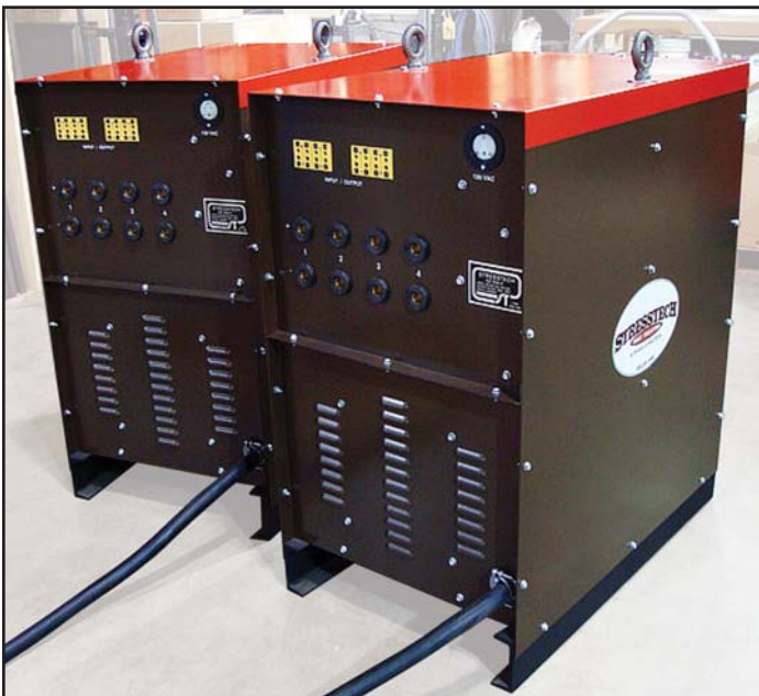
QZ500-4 Rear Panel