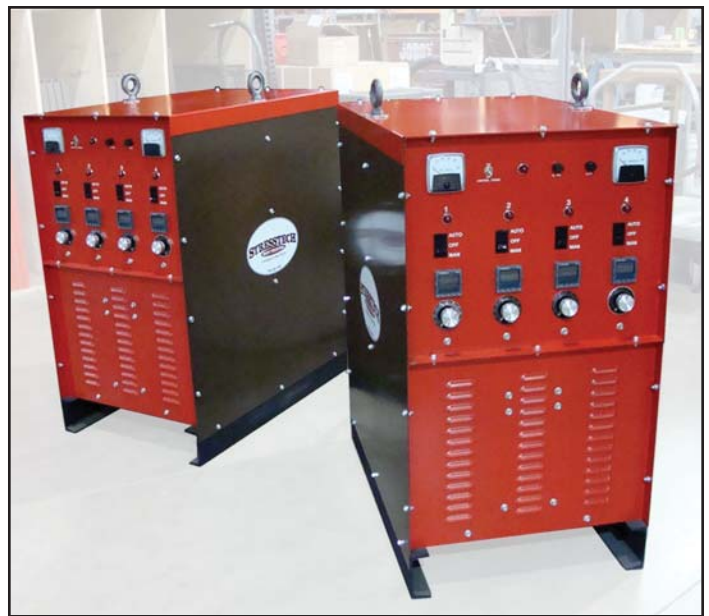
Stresstech QZ500-4 Heat Treating Console

Stresstech's QZ500-4 Portable Heat Treating Console provides 500 amps of power to four individual 300 amp resistance heating zones. Each zone is individually controlled, allowing the operator to run up to four different profiles simultaneously. The operator can begin separate heating cycles at any time without waiting for earlier cycles to finish. Simple to operate controllers make operator training quick and easy. Enter the "Soak" temperature and the controller will automatically ramp from the current temperature to the set point at the specified ramp rate. Disable the ramping function for manual operation, controlled using the percentage timer. Panel mounted Cam-Loks provide secure, fast and easy connections. Two, four-circuit type "K" thermocouple jack strips located on the rear panel permit connection to a temperature recorder. 300 amp zone protection and thermal overload sensors assure safe operation. Calibration and maintenance are easy with the removable control drawer.