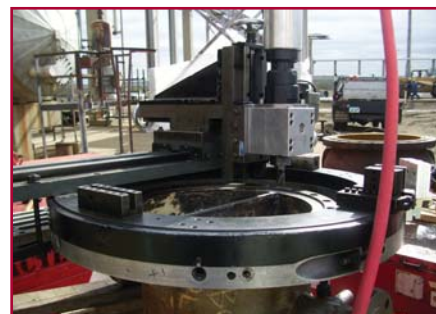
Milling Divider Rib

Regional Service Locations available nationally and internationally for quick response to your turnaround requirements.