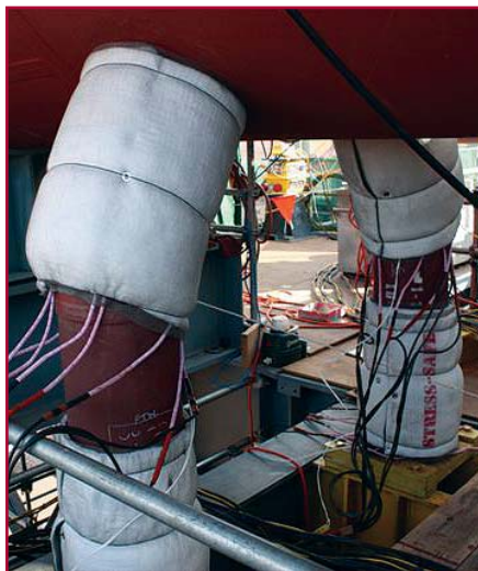
PWHT Multiple Welds

Regional Service Locations available nationally and internationally for quick response to your turnaround requirements.